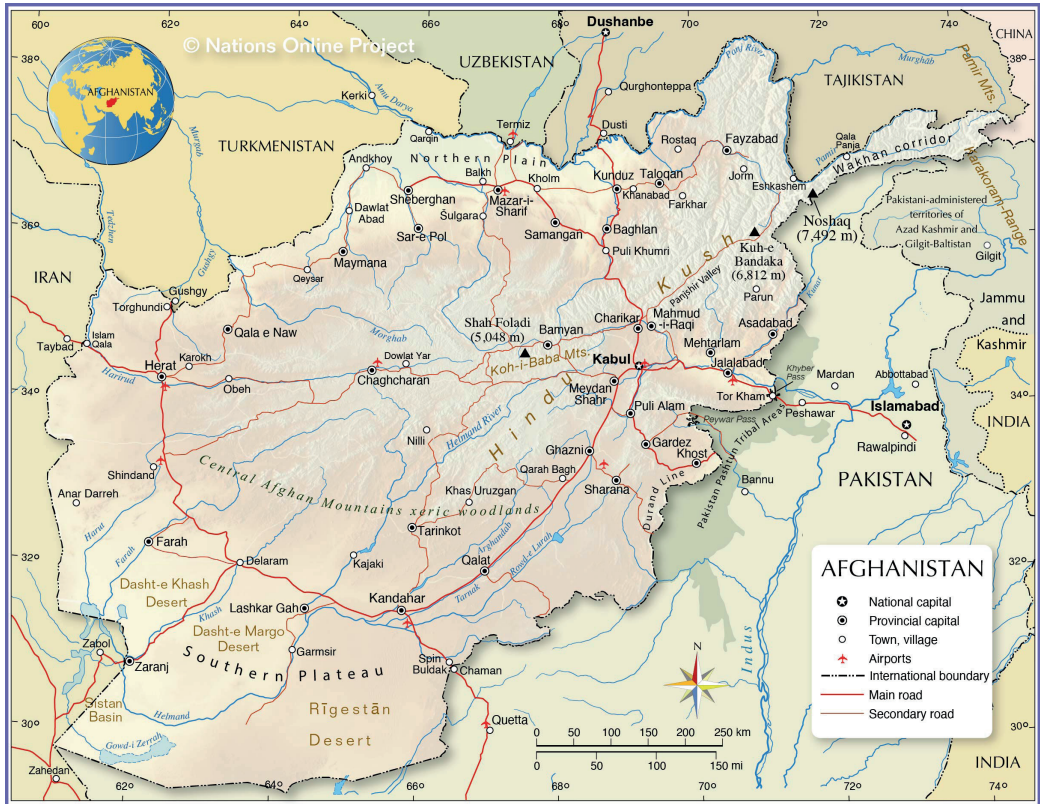
Figure 1. Map of Afghanistan