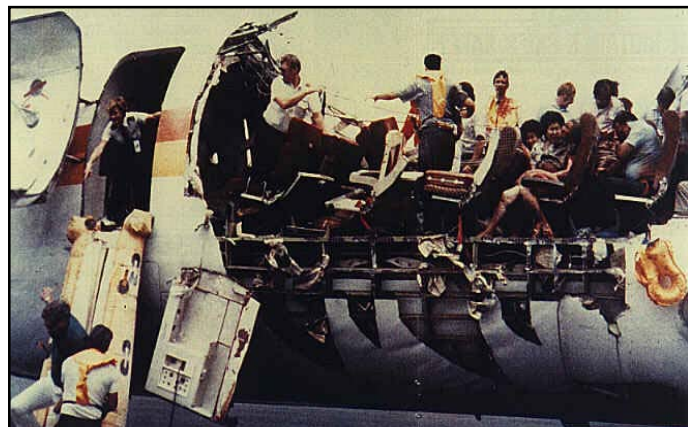
Fig. 1. Aloha Airlines Flight 243

Fierce winds and flying debris had injured many of those on board but, by grace and safety belts, only one person had died: senior flight attendant Clarabelle Lansing, who