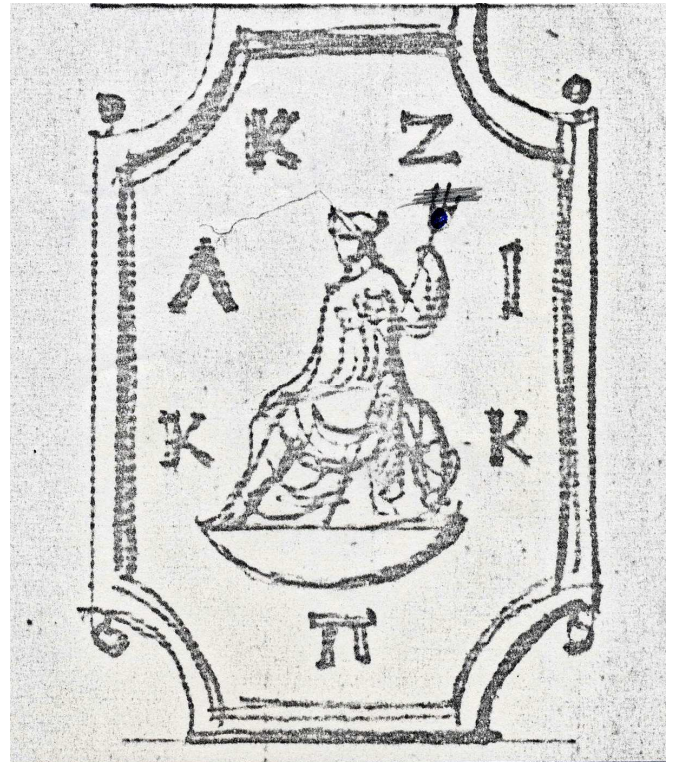
Drawing of the sign which featured on the exterior of the Ionian Bank's head office in the City of London, 1960s