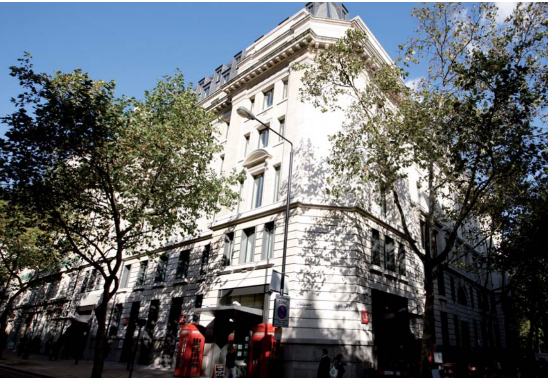
Executive Public Policy Training Programme, Beijing 2008

The partnerships developed by LSE go beyond simple declarations of shared purpose. They involve formal collaboration and exchange in teaching, research and other initiatives. Partnership activities enable LSE to have a direct engagement with other countries and serve to enrich immeasurably the international learning experience of all participants. LSE partnerships link together to offer a network of global excellence in academic exchange and programming.