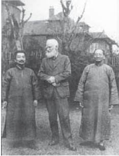
Long tradition of LSE-PKU ties: George Bernard Shaw, one of the founders of LSE, with the famous Chinese writer Lu Xun, left, and the chancellor of Peking University, Cai Yuanpei, right, in 1933

LSE has engaged with China since the School's foundation in 1895. When our founders, Sidney and Beatrice Webb, travelled to China almost a century ago, they observed a country with a remarkable culture and history. The current and future importance of China to the world economy is crucial and the need to engage and learn has never been stronger.