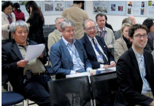
BIONET first conference