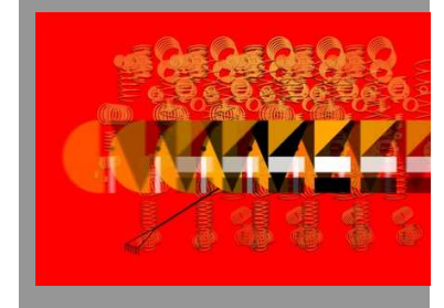
Critical Infrastructures at the Architecture Foundation from 2 February.