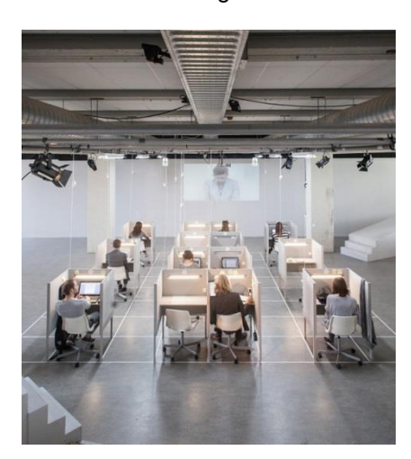
Out of Office project – 'rigid', image courtesy of Anna Dekker.

Anna Dekker (2012) recently completed a one-month project at the modern art museum MU of Eindhoven, The Netherlands. In collaboration with design studio KNOL, the project Out of Office was partly based on her individual project fieldwork during Master's, social-architectural а experiment questioning modern nomadic and flexible work ethic. First, nomadic workers were invited to work in a colorful, flexible and playful space. Over the course of time it slowly transformed physically and socially into a more highly regulated space with strictly gray cubicles. With this play of extremes, the project team carried out research to investigate whether we become more productive and less stressed when we hand over some self-discipline and work according to set hours.