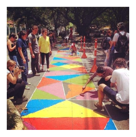
Tactical urbanism by La Ciudad Verde

At the World Urban Forum 2014 held in Medellin, La Ciudad Verde launched the first Colombian Urban Sustainability Award for best cities' efforts, and citizens' actions towards sustainability.