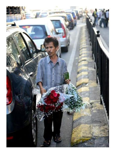
Roadside flower seller, Mumbai.