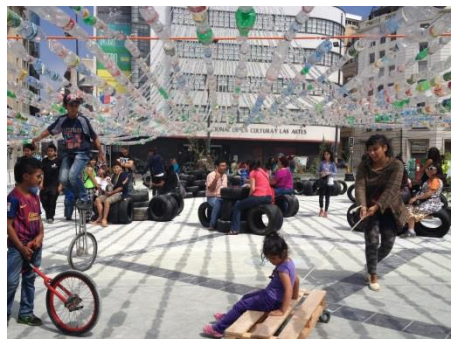
12,000 bottles...Valparaíso, image courtesy of Javier Vergara Petrescu.

The project "Recycling OkuPlaza," commissioned by the National Council of Culture and Arts, was built in Valparaíso in January 2013. The starting point was the need for greater awareness and practice of recycling in the area. In month, Ciudad Emergente а collected more than 12,000 bottles with which high-impact а intervention was created in an important central space in the city. This under-utilised space was filled with life for a few days and the intervention helps to raise awareness about the problem and encouraged community members to share ideas about improving their environmental impact.