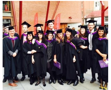
Class of 2014 at graduation ceremony, image courtesy of Benno Rembeck.

Cities Programme newsletter issue 15 Lent Term 2015