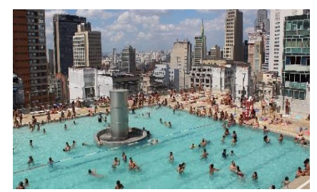
Shaping Cities in an Urban Age book launch

Shaping Cities in an Urban Age is now available for pre-order from www.phaidon.com.