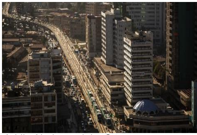
Addis Ababa aerial - C40

Register your interest: Urban Age Developing Urban Futures Conference