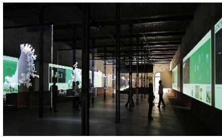
Conflicts of an Urban Age - Urban Age

This exhibition describes how six cities – Addis Ababa, Istanbul, London, Mexico City, Mumbai and Shanghai – have changed. A closing event will take place on 16 October.