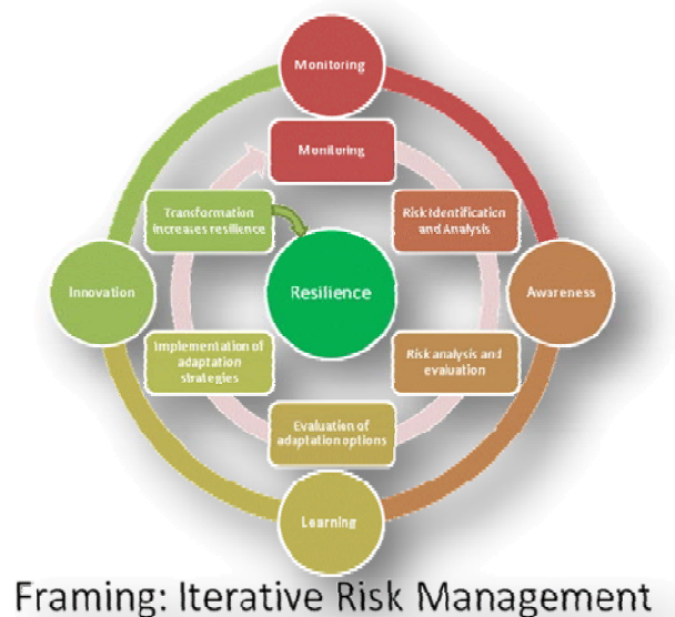
Figure: Framing adaptation around a notion of iterative risk management