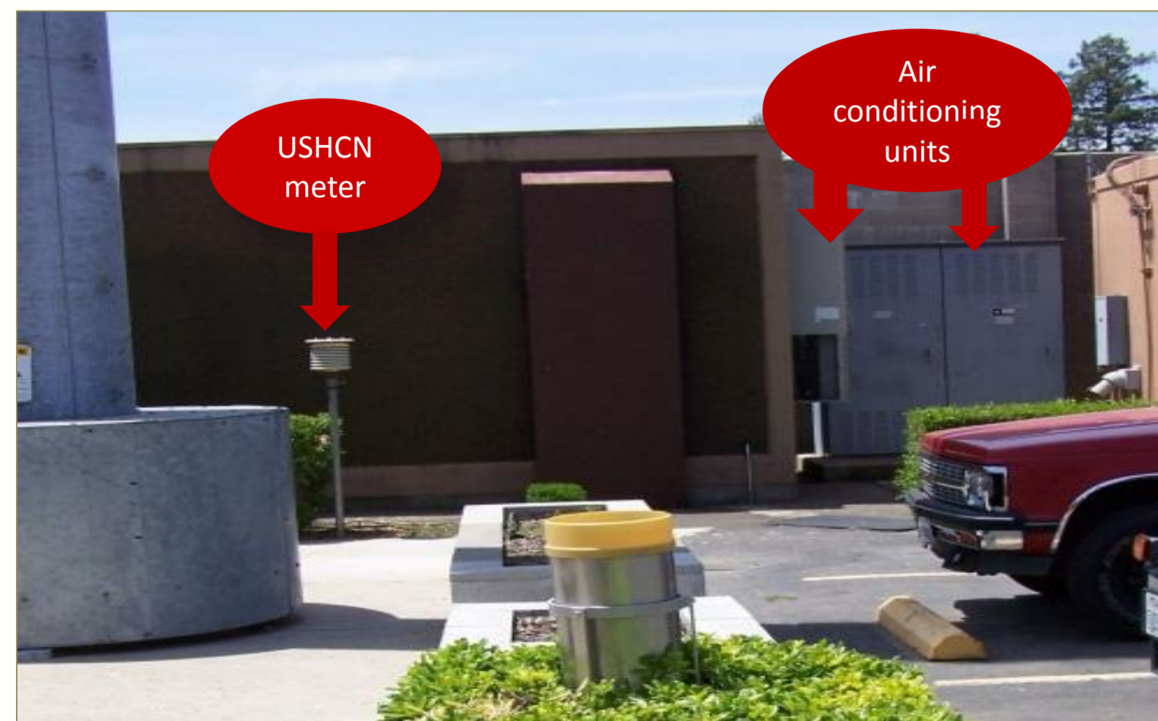
Weather station at Marysville, California

Some errors in the dataset are hard to spot. For example you wouldn’t trust the data from instruments this close to air conditioning units.