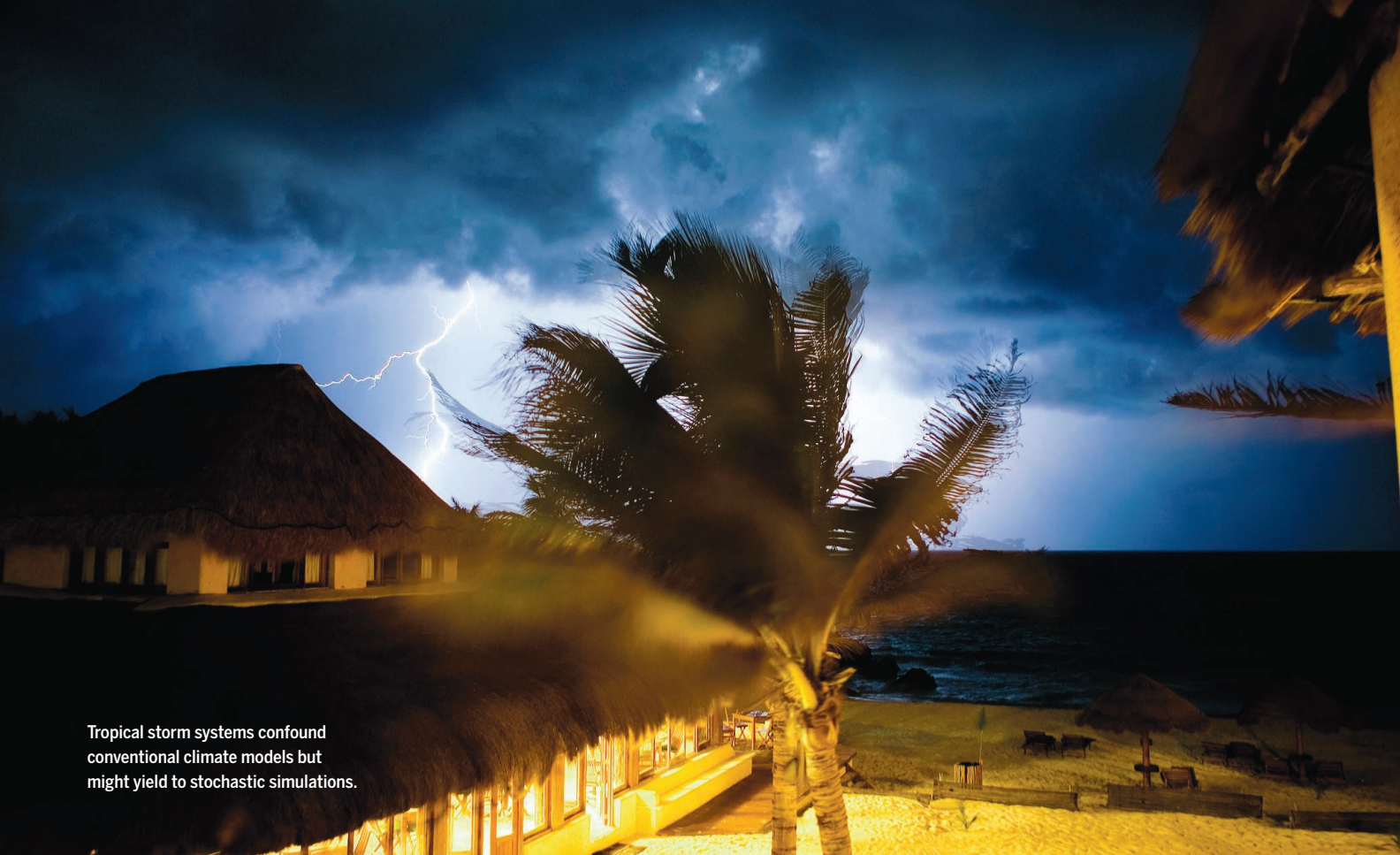
Tropical storm systems confound conventional climate models but might yield to stochastic simulations.