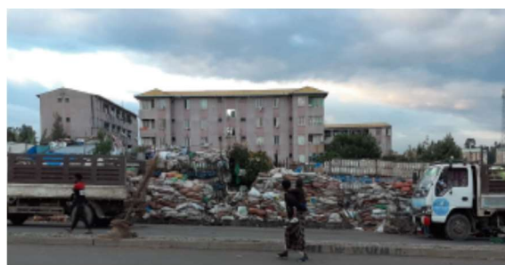
Figure 6. Improper temporary waste storage site.