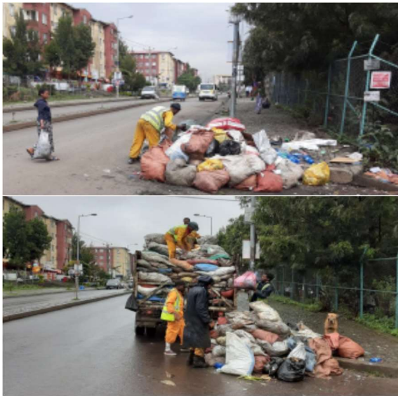
Figure 7. Wastes collected from households, to be transported to the temporary storage sites.

trucks came for collection, the crew used their vehicle horn for calling users. Then people would bring their wastes for unloading to the trucks. However, the drivers did not wait for an adequate time. So, people who brought their waste but did not meet the truck would be forced to dump on the undesigned areas such as the streets, ditches and rivers. There was no properly designed collection route system using maps and pertinent data, thus there was high unproductive time and the trucks were not used with proper frequency. There were no standard operating procedures manual. Currently, members of the MSEs collect wastes every other day from households. When they come, they blow the horn as a signal of their coming, and then residents bring their wastes out and put them in a common place in the villages (Figure 7), and then they will be transferred to the transferred stations by MSEs.