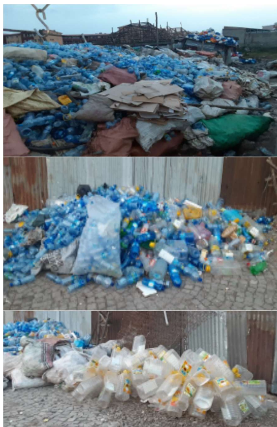
Figure 9. Collected plastic bottles (in condominium sites) for reuse and recycling.

Recyclable materials without direct commercial value and/or immediate reuse were usually not separated from the waste stream. Some craftsmen recycled metal, wood, rubber tire, clay, etc. to provide essential goods including usable spare parts to a great number of customers. The nucleus of these activities was and still are Merkato areas in Addis Ketema sub-city. Although there were no formally organized Western type of recycling centers and big enterprises, there were informal recycling activities. In Reppi (Koshe) landfill, 200 to 300 scavengers practiced waste recovery by collecting salvageable materials in 2003. NGOs such as ENDA were engaged in organizing the informal recycling sector through community-based waste management schemes in earlier times.