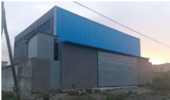
Figure 8. Sample new transfer sites being built in different parts of the city

Thus, as part of tackling this shortage of waste containers, the existing Cleaning Management Agency has not yet finalized the set-up of transfer stations based on the selection criteria such as road accessibility, areas' slope, sensitive areas such as schools, churches, mosques, etc. in the city. Several efforts had been made in the then Development Plan implementation period to improve the efficiency of solid waste management services. However, the issue has not yet reached the level demanded to alleviate the existing solid waste problems in the city. Currently, however, transfer stations are proposed in the existing development plan to ensure efficient delivery of solid waste collection and disposal services to serve as a bridge between community-based solid waste collection endeavours and a waste disposal facility (Figure 8). At present, there are 311 transfer stations in Addis Ababa.