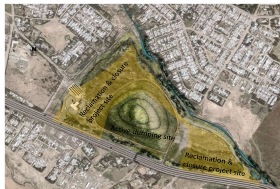
Figure 12. The internal condition of Koshe open disposal site.

It was recognized that this dump site had posed a negative physical and health impact on residents living around the city. Thus, the city government had not given attention to the establishment of a new sanitary landfill site until 2009. But a new landfill has been established in the Oromia National Region State some 35 km away from the city center in the Sendafa area locally named Chobe Woregenu. However, it has not yet been under operational practice due to administrative boundary issues. Yet, its long distance away may cause fleet-management problems even when it becomes operational. This might affect the efficiency of the collection system and also increase operating costs (fuel, oil, grease) when it comes to operation.