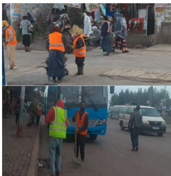
Figure 4. Street cleaning activities at different areas in the city.

The primary collection system is the one that is carried out by Micro and Small Enterprises (MSEs) from door-to-door in households. It is estimated that there are about 707,817 households at present in the city. The secondary collection system is the block (container) collection that is carried out by private companies in hotels, hospitals, schools and other service delivery and manufacturing organizations. The third is the street sweeping system that is conducted by the sub-city (Figure 4). About 25% of the solid waste generated in Addis Ababa is still indiscriminately dumped within residential neighborhoods as before, while the remaining 65% is collected but disposed of in an unsanitary manner at Reppi/Koshe controlled dumping site. Currently 95% of the city's solid waste is collected through the door-to-door collection system by MSEs and the remaining is collected by private companies.