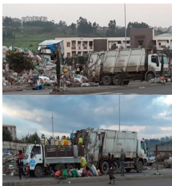
Figure 3. Loading of solid wastes from transfer sites for final disposal at Koshe disposal site.