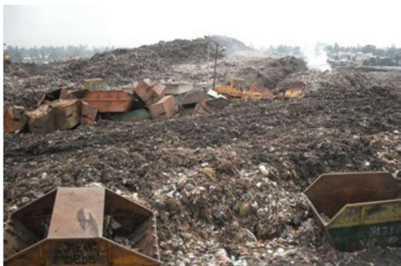
Figure 11. Koshe solid waste open disposal site view.

It is believed that the generation of solid wastes in a city can never be stopped; hence, solid waste management must use landfills for disposal. As has been stated above, the existing single open disposal site in Addis Ababa has served the city for more than 55 years so that it has now reached its full level. Having recognized the problems, the former Development Plan identified sites for the construction of four new landfills at various locations namely in the eastern part of the city (Bole-Arabsa), western part (Fili-Doro), northeastern (Yeka-Abbado), and southeastern (Dertu-Mojo). These sites were selected for the final treatment and disposal of solid wastes generated in the city. However, none of them was constructed as planned. The city government of Addis Ababa still utilizes the Reppi (Koshe) site as the only open solid waste disposal location. The site has no daily cover with soil, nor any odor or vector control, so that it can have a negative environmental health impact as it is an open site in the city.