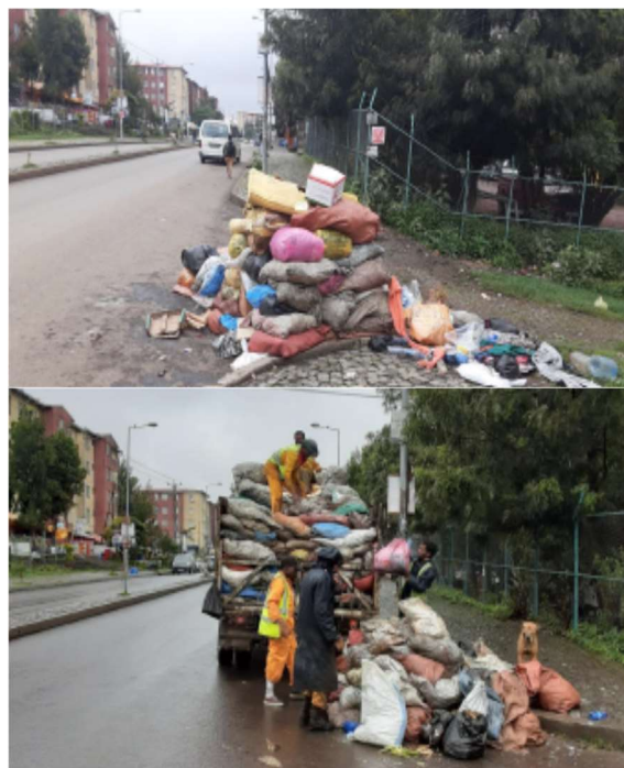
Figure 2. Solid waste collection from households in condominium areas for transportation to transfer sites.

located at different collection points in the city. In most parts of the city, the communal collection points have been located at roadsides and vacant plots (Figure 2). Of the total generated waste, 25 % is still dumped in riverbanks, empty sites, drainage channels, ditches, etc. In the early 2000s, about 33% of households in the city were provided with door-to-door collection services. A comparison of the city's past and present solid waste generation and disposal is shown in Table 2.