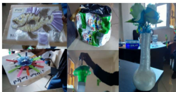
Figure 10. Teaching aid materials (source: District Waste Management office, Bole sub-city).

Addis Ababa's recycling sector currently faces several challenges which limit its expansion. Local recycling activities have difficulties to acquire land to establish recycling facilities. Various financial barriers also exist such as equipment and facilities, and limited access to finance. Financial, technological and human capacity constraints further prevent local recycling companies from participating in the entire recycling value chain. If adequately supported, the recycling sector could help address the city's long-standing solid waste management problem while at the same time creating jobs (e.g., Figure 10) and helping the city shift towards a more circular economy.