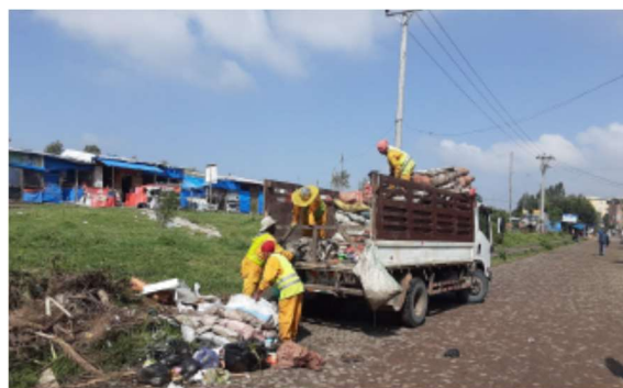
Figure 5. Waste is collected from open markets by members of the MSEs.

These service charges have been considered to discourage illegal dumping in the city. Hence, the city's plan to implement charging fees for solid waste collection services has been achieved and become successful. In this regard, sanitation service fees of 30 Birr per cubic meter for MSEs and 70 birrs per cubic meter for private companies (240 Birr for MSE and 560 for private companies) were paid as the rate per an 8 m 3 container of solid waste collected. But it has been investigated that the existing means of payment have not been made applicable for all waste generators across the city. This is because commercial centers in the city such as Merkato, Piassa and other open marketplaces (e.g., Figure 5) do not all use water supply services, yet they are huge generators of solid wastes in the city. Therefore, the practice has been changed so that the solid waste management issues have now been connected to the coordinated efforts of the city.