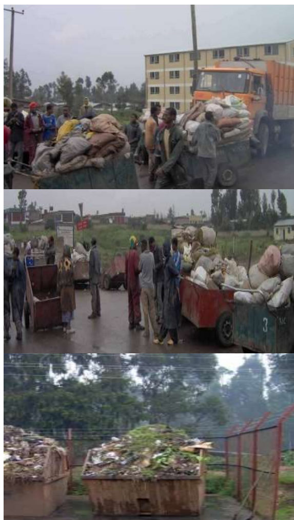
Figure 1. Photographs of primary and secondary collection systems in the past.

The ever-increasing economic, social and administrative activities in cities generate various types of solid wastes that need to be properly managed. In Addis Ababa, it is estimated that 3,200 tonnes of solid waste are generated per day. Yet, only 65% of solid waste reaches the city's open dump site. Currently, the collection of these wastes in the city is also carried out in three different types of collection systems: primary (Figure 2), secondary (Figure 3) and street sweeping (Figure 4).