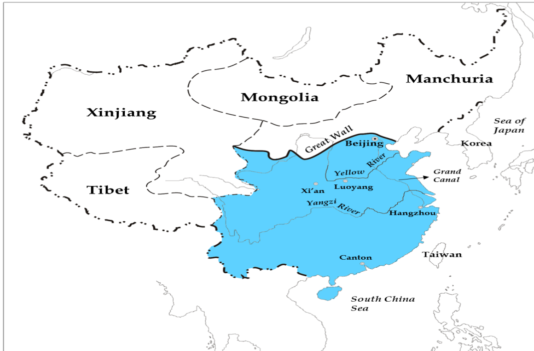
Map 1. Chinese Territory under Ming (shaded) and Qing