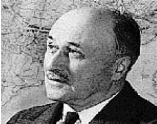
Founding Father Jean Monnet