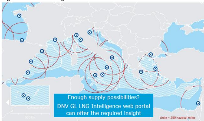
Figure 1. Existing LNG Terminals in Mediterranean Sea

In such a case, the region of South-East Mediterranean could provide more LNG bunkering spots as LNG is the marine fuel of the future (Chiotopoulos 2016).