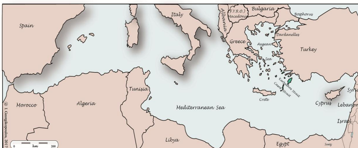
The Dodecanese; an important Mediterranean crossroads

The geo-economic and geopolitical framework in the Eastern Mediterranean modifies the role of intermediate regions by transforming them into buffer zones. Situated at the crossroads of hydrocarbon fields and tension zones, as well as between Oriental realities and Occidental conceptualisations, the Dodecanese archipelago has recently found itself in the middle of old geopolitical oppositions (Aegean dispute), new regional dynamics (Energy agreements), European ambivalence, and the controversial postures of the Greek political leadership (external border strategies and migration crisis). These situations should not be considered in isolation; if combined, they mirror the complexity, but also the complementarities, of multi-scaled geopolitical interactions. As a result, shifting 'glocal' politics underline the need to rethink and reconceptualise former geopolitical categories.