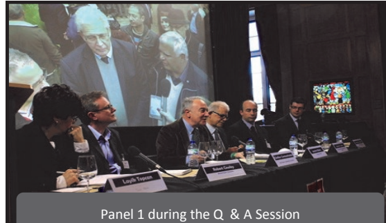
Panel 1 during the Q & A Session

Recently, however, Turkish Cypriots living in Famagusta have joined with displaced Greek Cypriots to demand the opening of Varosha under UN supervision, the return of property to its legal owners, the opening of Famagusta port under EU supervision, and the listing of the walled city as a UNESCO heritage site. The conference brought