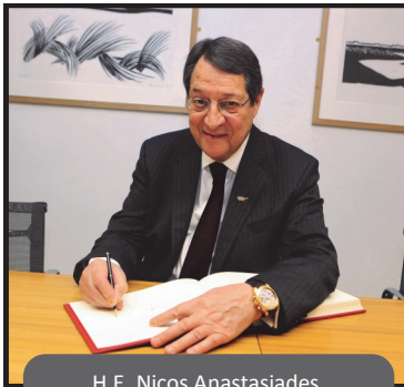
H.E. Nicos Anastasiades, President of the Republic of Cyprus, signing the LSE's visitor book

He had previously spoken at a closed policy roundtable at the School in November 2012 when he was still a candidate for the Presidency. At that time, he had laid out a vision for his administration across a wide variety of external policy areas. This time, as leader, he set out the key foreign policy challenges and opportunities facing the island during a period of particular turbulence and change in a lecture entitled, 'The true story about the geopolitical role of Cyprus: David or Goliath?'