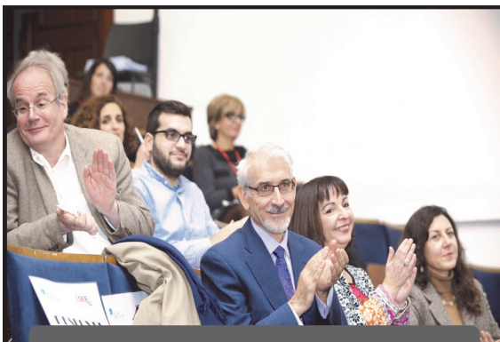
The audience in the New Theatre

The lecture was followed by a lively Q & A session and a private dinner.