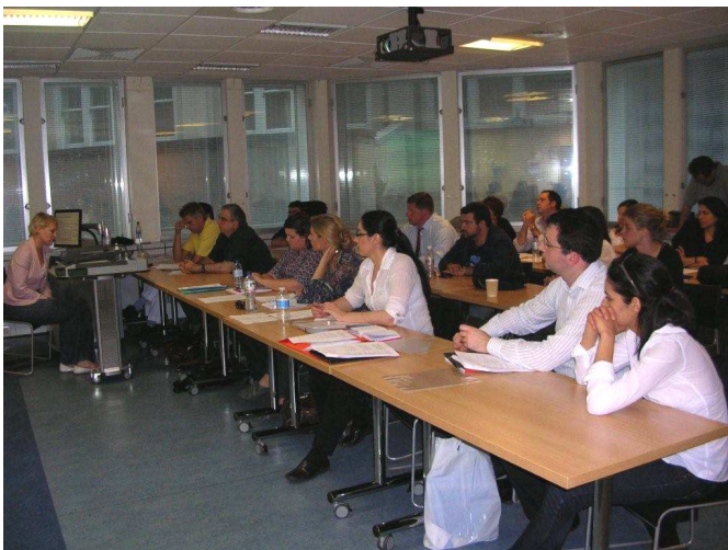
Symposium Panel Meeting

The 4 th Hellenic Observatory PhD Symposium was held on 25 and 26 June and attracted over 100 paper givers from Europe and beyond. As ever the topics of PhD research were diverse and we had to divide the 27 specialist panels into 5 sessions to accommodate them all.