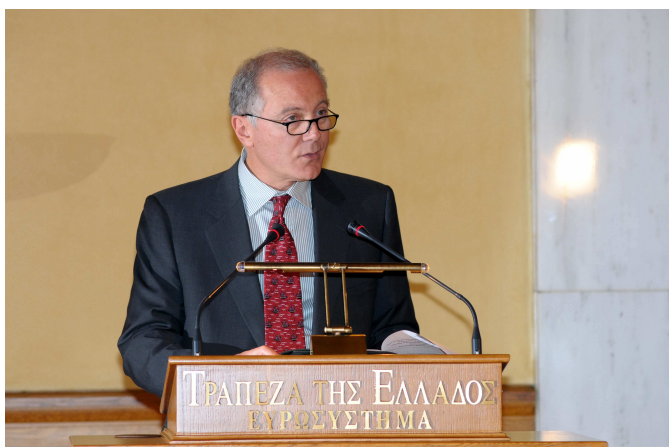
Professor Georgios Provopoulos, Governor of the Bank of Greece

The conference was held at the Bank's prestigious premises and was hosted by the Governor, Professor Georgios Provopoulos . An array of international speakers addressed the conference. From the LSE, Professor Willem Buiter attacked what he called the 'fiscal and regulatory vacuum' at the heart of the EU's governance. Dr Daniel Gros , Director of the Centre for European Policy Studies in Brussels , compared the nature and impact of the crisis across Europe and the US.