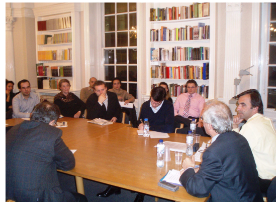
Hellenic Observatory Research Seminar