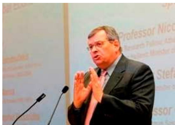
Stefanos Manos, Former Minister of Economy and Finance