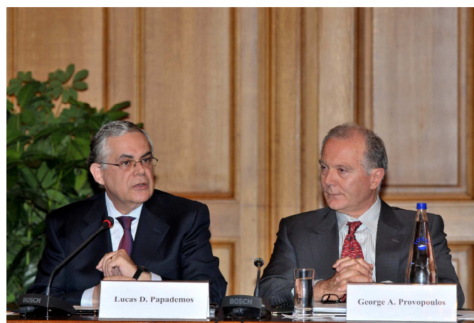
From Left to Right: Dr Lucas Papademos, Vice-President of the European Central Bank; Professor Georgios Provopoulos, Governor of the Bank of Greece