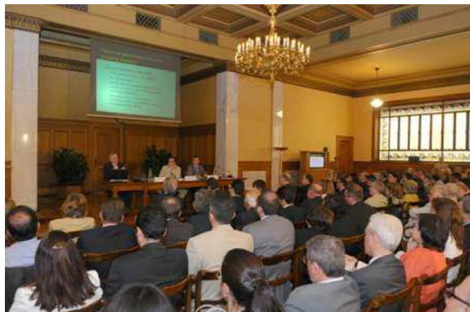
Packed Auditorium at the Bank of Greece

The focus switched to the role of the central banks in managing the way out of the crisis, with presentations by Lucas Papademos , Vice President of ECB ; Ewald Nowotny , Governor of the Austrian Central Bank ; and Florin Georgescu , First Deputy Governor of the National Bank of Romania .