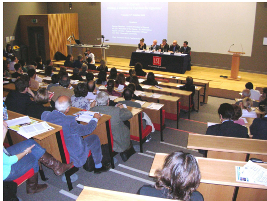
Hellenic Observatory event Sheikh Zayed Theatre, London School of Economics