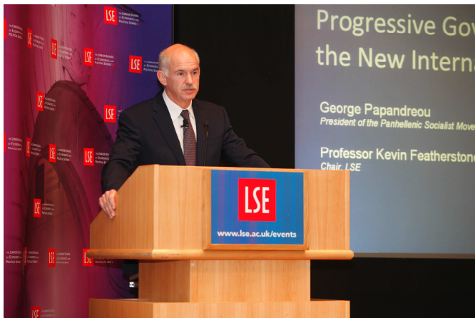
Mr George Papandreou

George Papandreou, leader of PASOK (Panhellenic Socialist Movement), the main opposition party in the Greek Parliament, gave a public lecture at the School, hosted by the Hellenic Observatory. This was followed by a well-attended reception in the Atrium of the Old Building.