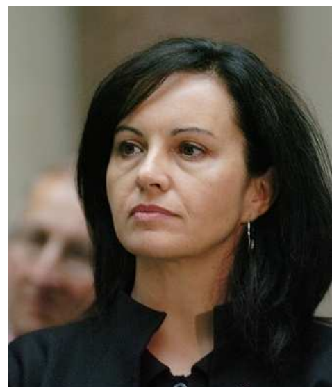
The Minister for Europe Rt. Hon. Caroline Flint MP

then followed by a question and answer session. Once again, the Minister continued to reiterate the benefits of a peace deal, and pointedly refused to engage in speculation about the possible breakdown of talks. As she noted, ‘this was too good an opportunity to miss’. There is no ‘Plan B’ for Cyprus.