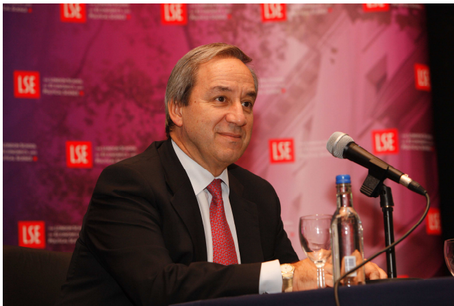
Professor George Alogoskoufis

The Ninth Annual Lecture of the Hellenic Observatory was given by George Alogoskoufis, then Minister of Economy and Finance . Professor Alogoskoufis is a distinguished alumnus of the LSE, having obtained both his MSc and PhD in Economics from the School.