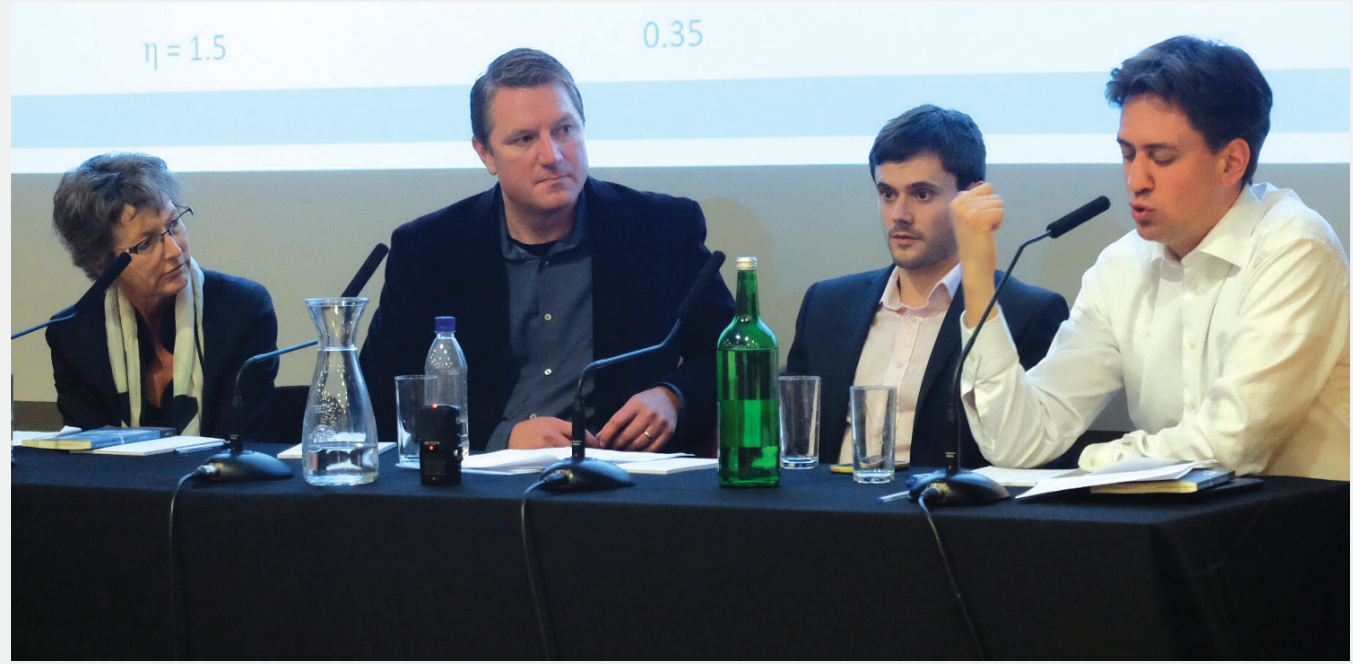
The Myth of Millionaire Tax Flight: how place still matters for the rich

Twenty-five years since the break-up of Yugoslavia, the successor states record different levels of income inequality. Slovenia has one of the lowest levels of inequality in Europe, Serbia the highest, while Croatia has an intermediate position. Using the latest survey data (the EU-standard SILC survey on incomes and living conditions) the speakers explored the sources of income that are most important for explaining the emergent income inequalities.