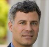
Alan Krueger Princeton, former CEA Chair