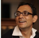
Abhijit Banerjee MIT, co-founder of J-PAL