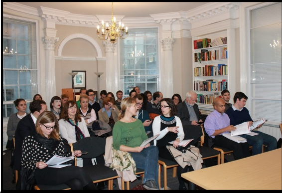
The audience at the Canada Blanch Room

A series of research and policy seminars