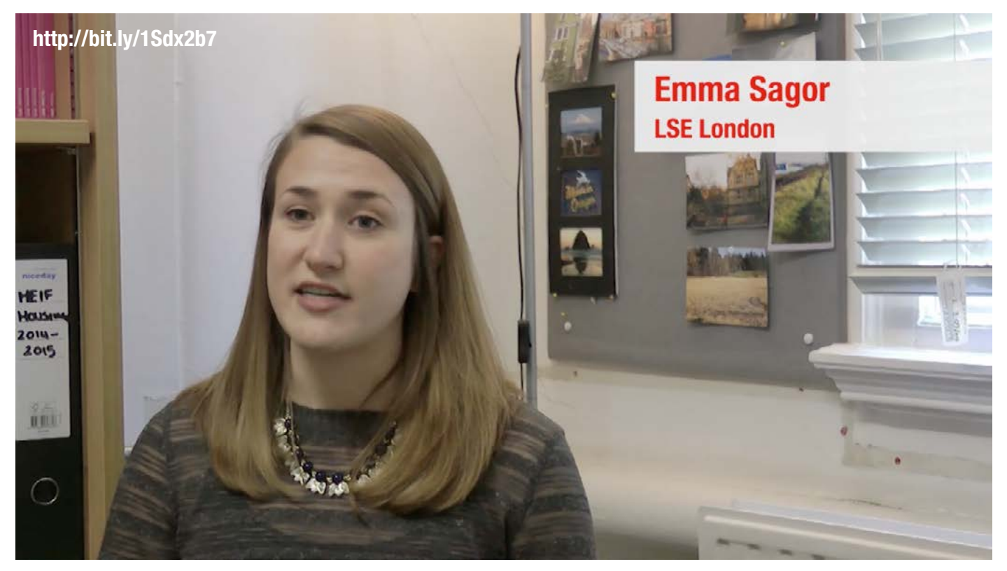
click on the link to watch the video