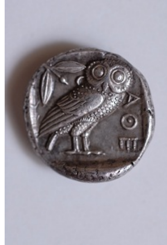
Tetradrachm, Athens (reverse).