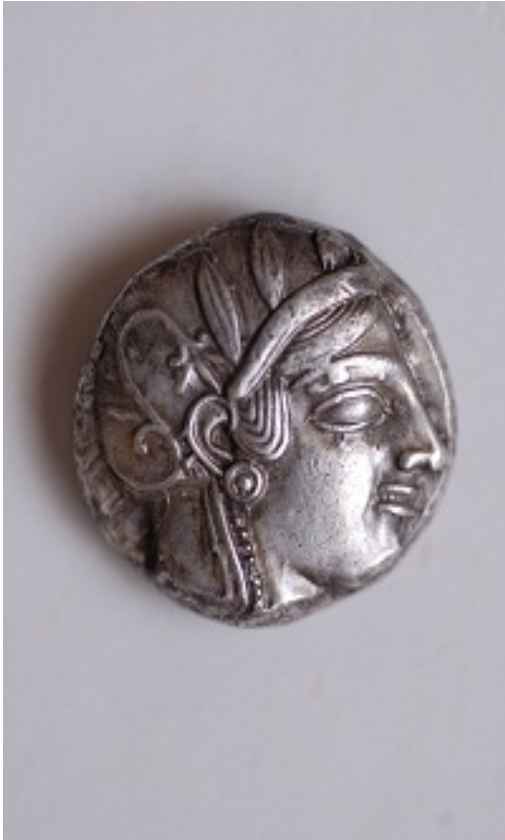
Tetradrachm, Athens, Antique Greece, - 2500BC – 1 st century AD.