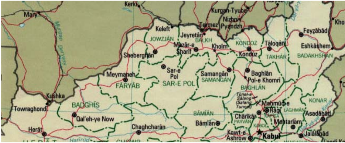
Figure 1: Map of northern Afghanistan.