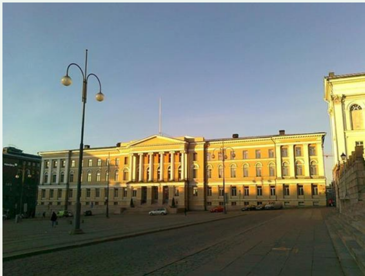
Conference venue – University of Helsinki

I presented the findings of my paper about the influence of grandparental investment on child health in rural Guatemala and received some very useful feedback from interested delegates. In short, I used measures of direct grandparental support on child height (in a highly resource-stressed population) and found evidence for the strongest positive influence of paternal grandmothers; an unusual finding given the literature that usually finds maternal grandmothers to be most beneficial for child survival and other health outcomes.