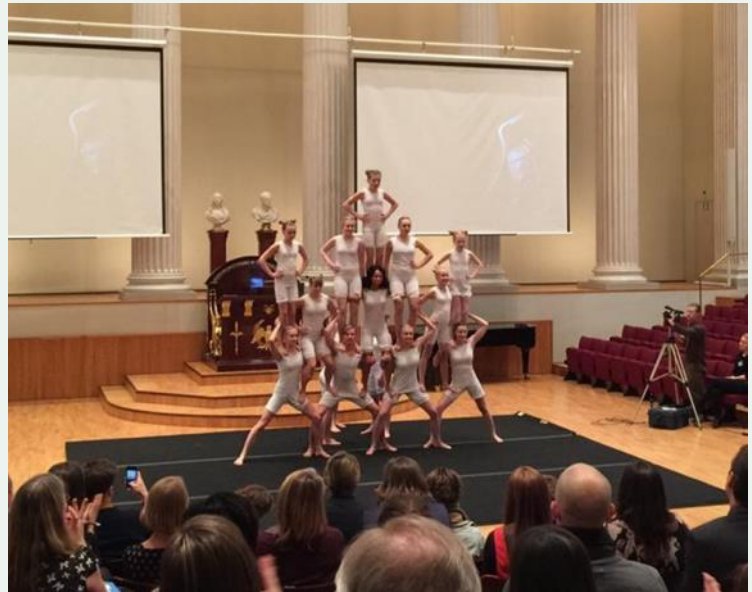
Helsinki Circus opening the conference