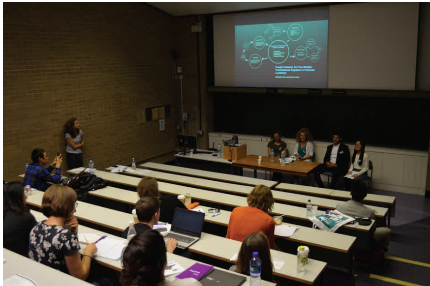
Discussion after Session 8 "Migration and Integration"