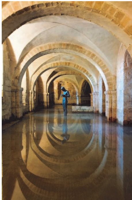
Anthony Gormley's statue in Winchester Cathedral