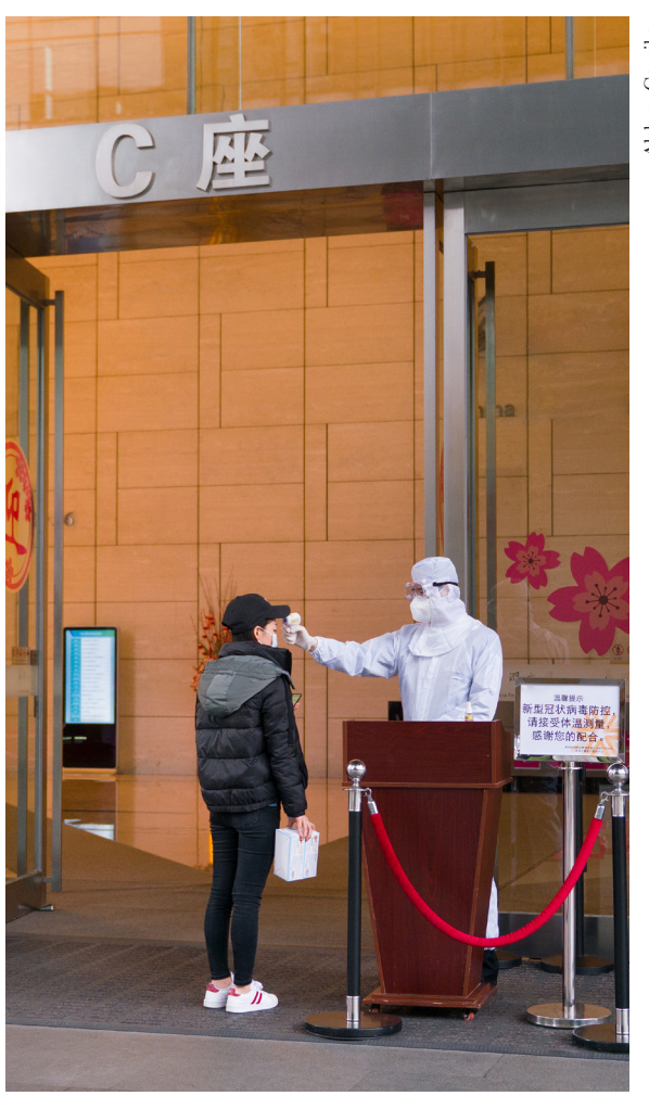
A security guard checks a visitor's temperature in Wuhan, China

New authoritarians play a particular role in this context. They do not propose reforms to substantially