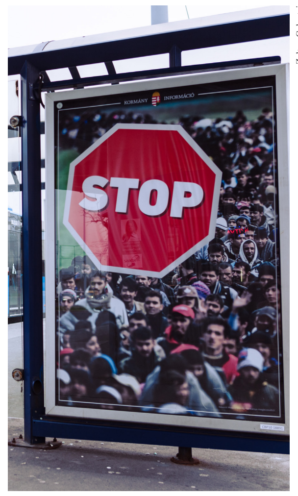
A Hungarian government anti-immigration poster

The question moving forward is whether the West will accept the idea that some of its countries want to be governed by a different set of rules. It is an open question whether the European Union can continue to function, or even exist, if its members do not share the