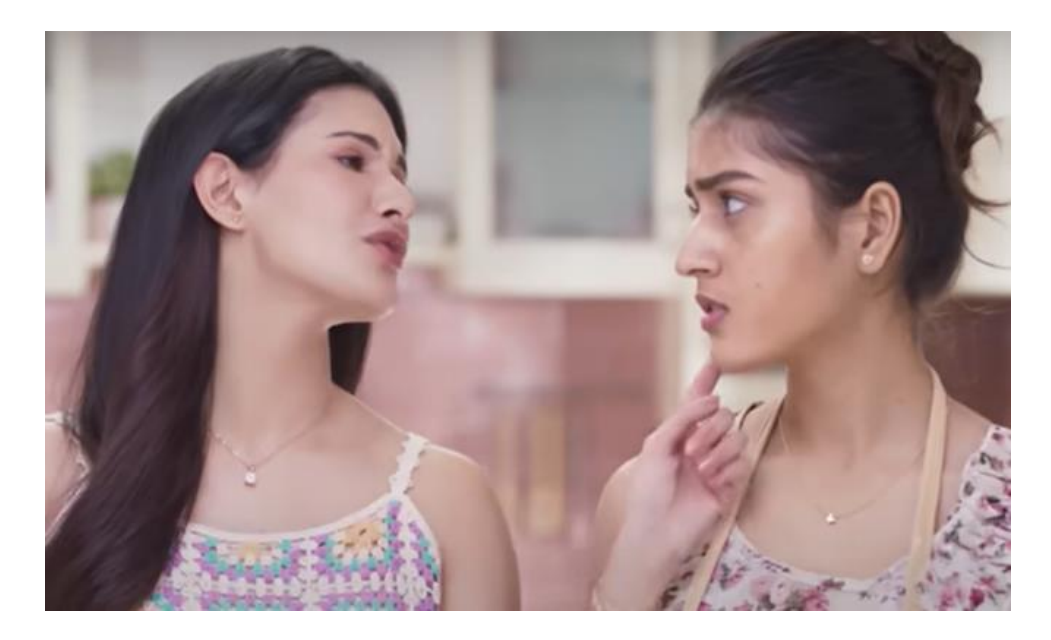
Figure 1. The 'oily' touch in Lacto Calamine (See Figure B1)

This touch, seemingly coded as reassuring, is also witnessed in the Garnier (2018: 0:29-0:30) advert when we see the protagonist apply the product on her friend's face in a ritualistic action of care. It must be noted that friendliness is extended only after the protagonist divulges a list of problems she sees on the face of her acquaintance. In both the advertisements, we witness normative cruelties being inflicted upon these women, but the rhetoric of intimacy, as denoted by the language and behaviour, makes this symbolic violence appear loving, and even natural and necessary. Therefore, a 'loving meanness' (Winch, 2013: 16) is seamlessly generated through actions that come across as empathetic, but are accompanied with dialogues that are scrutinizing and cruel.