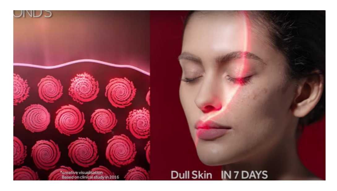
Figure 5. Scientific visuals (See Figure B3)