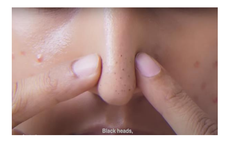
Figure 4. Zoomed in visuals of 'problems'

advertisements achieve abjection is through dramatic editing. In Lacto Calamine (2022: 0:13-0:14), every scene has been filmed from a consistent distance except the ones showing 'problems' (pimples, patchy skin, blackheads, dark spots) that the woman suffers from. Figure 4 shows an example of how these are the only shots that are zoomed into. The distinction is prevalent especially in the scene where the camera pans in at a considerable speed before the product transformation is witnessed. While the threat of invisibility already existed due to classist coding of representations as discussed in the previous section (notably, the one providing aid is once again fair skinned), exclusion is further imprinted through these visual cues of abjection on the face of the concerned, helpless woman. This is precisely the second way in which abjection is symbolized: through expressions of concern and unhappiness.