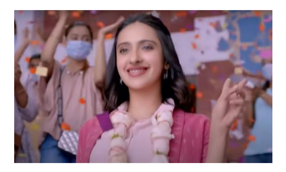
Figure 3. The successful young girl from Glow & Lovely (See Figure B2)

First, subjected to the gaze of her friend that asserts the glow leitmotif , a distinct postfeminist shift is marked where attractiveness becomes the 'ultimate measure of success for a woman' (Elias et al. , 2016: 25-26). Seemingly, her accomplishments are evidenced by her appearance that corroborate with the discourse of fairness. 'Public' achievements aside, her 'private' body must be beautiful, and normatively perfect (McRobbie, 2015).