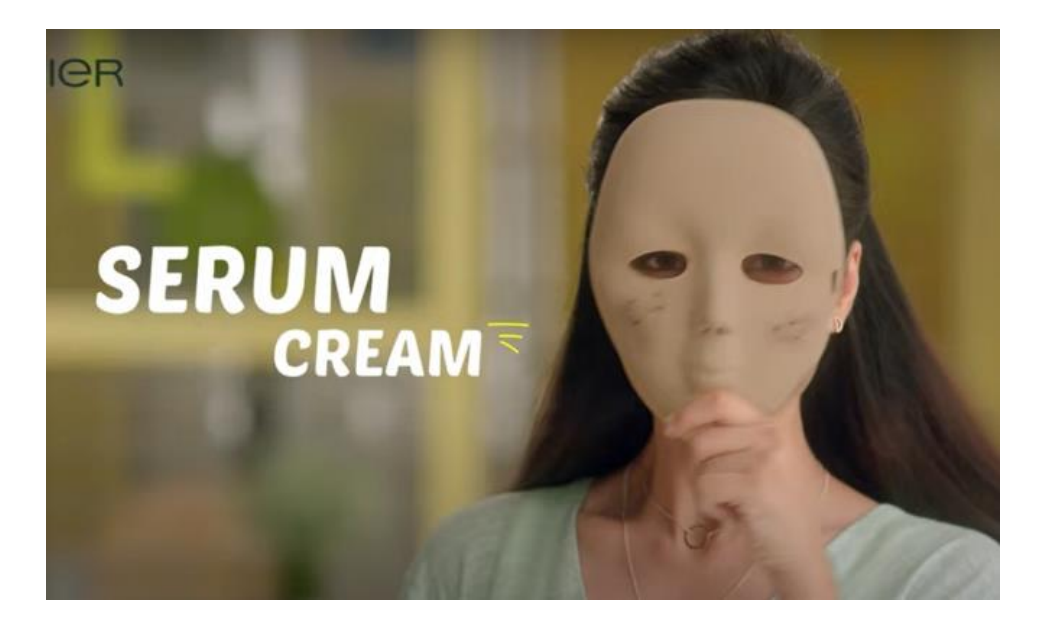
Figure 2. The mask in Garnier

For example, in the advertisement by Garnier (2018: 0:19-0:29), the fair-skinned friend presents the risks of dark 'sun spots' to her dull-skinned friend, because of which she can't step out and 'shop, eat, chill'. She then solves her 'problems' by presenting a solution for brighter skin that will help her be presentable to the world. The scene is supported with a representative element that is unique to this advertisement, as seen in Figure 2: a dull mask with dark spots, which is then removed to reveal bright skin. It concludes with both friends standing side-by-side, smiling; their complexion is now similar and notably fairer.