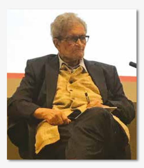
NOBEL LAUREATE AMARTYA SEN (HARVARD) AT LSE SOUTH ASIA CENTRE, 27 JUNE 2017.

'The Argumentative Indian' — a documentary on Amartya Sen's life and work followed by a discussion with Sen and Mukulika Banerjee (LSE) as Moderator in collaboration with the Bagri Foundation London Indian Film Festival 2017: