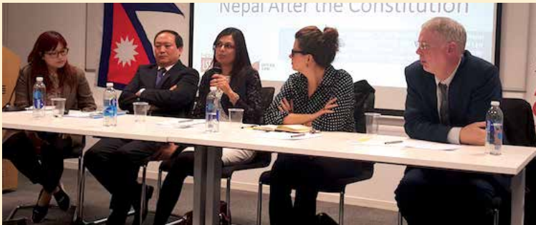
PANEL DISCUSSION ON 'NEPAL AFTER THE CONSTITUTION' IN PROGRESS, LSE, FEBRUARY 2016

In February 2016, the South Asia Centre worked with the LSE-SU Nepalese Society to host a round table discussion on 'Nepal after the Constitution', exploring what the impact of the long-awaited new