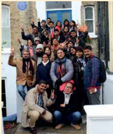
STUDENT DELEGATION OUTSIDE 10 KING HENRY ROAD, NW3 — B R AMBEDKAR'S RESIDENCE WHEN HE WAS A STUDENT AT LSE, NOVEMBER 2015