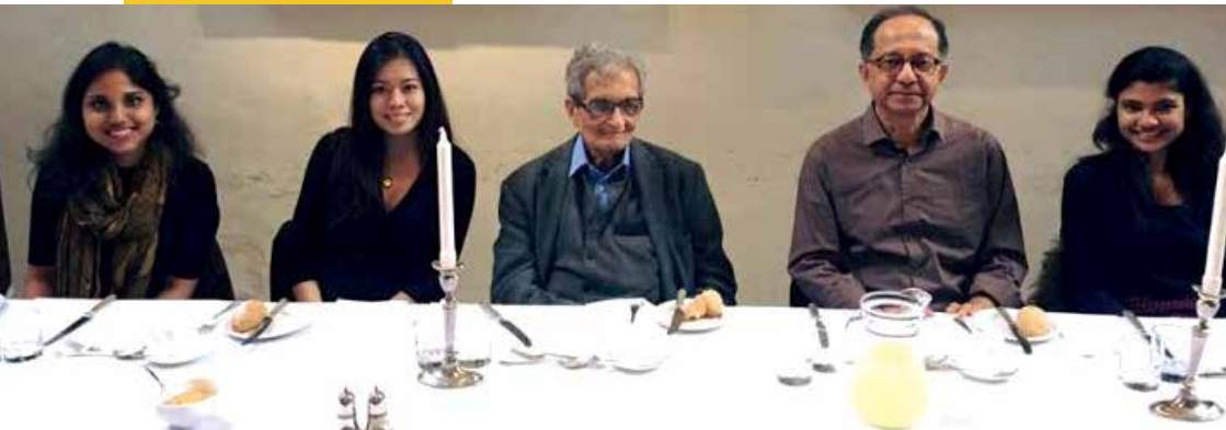
MEMBERS OF THE LSE AMARTYA SEN CLUB HAVING DINNER WITH AMARTYA SEN AND KAUSHIK BASU