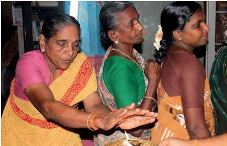
TAMIL JAIN WOMEN, FROM OUR BLOGPOST BY MAHIMA A JAIN, DECEMBER 2015