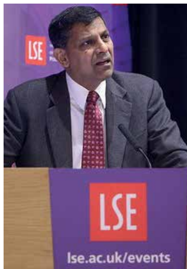
RAGHURAM RAJAN, GOVERNOR OF THE RESERVE BANK OF INDIA, AT LSE, MAY 2016

Other events included a conversation with S Y Quraishi (former Chief Election Commissioner of India), and further events are being planned.