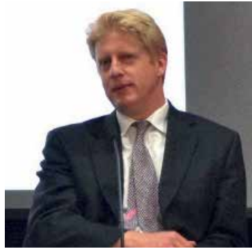
MINISTER OF STATE FOR UNIVERSITIES AND SCIENCE JO JOHNSON IN CONVERSATION, LSE, JUNE 2016

Events are regularly live-tweeted so that those unable to attend can follow the discussions in real time. We also Storified our most popular events this year, offering a social media overview even before the event podcast or write-up was available. As the Centre produces so much content, we also send monthly newsletters summarising our latest activities to keep subscribers up to date.