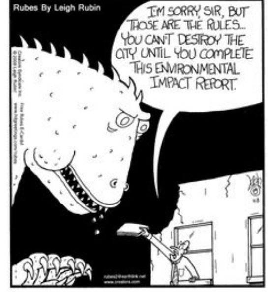
Godzilla versus the bureaucracy

EISes, EIRs, FONSIs, and Mitigated Neg Decs: walking through the NEPA and CEQA processes.