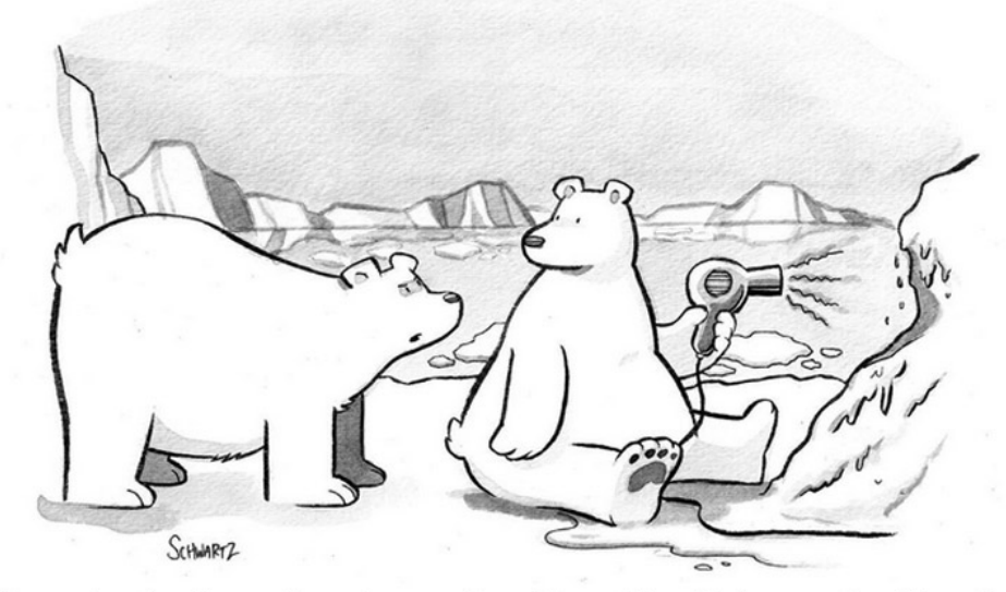
"I recognize that climate change is a complex subject with multiple causes, but this really isn't helping."

<u>Climate science basics</u> for policy analysts. <u>Video (2 min.)</u> When science led policy: the Montreal Protocol. Two-level games in international relations.